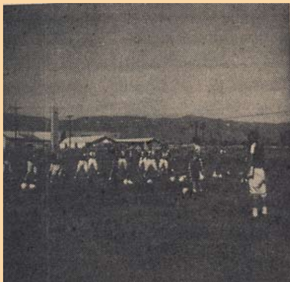
VARSITY EAGLES strain for top conditioning to face the season ahead.