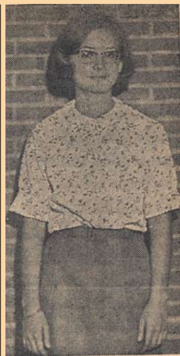
French Miss Poses For Our Camera