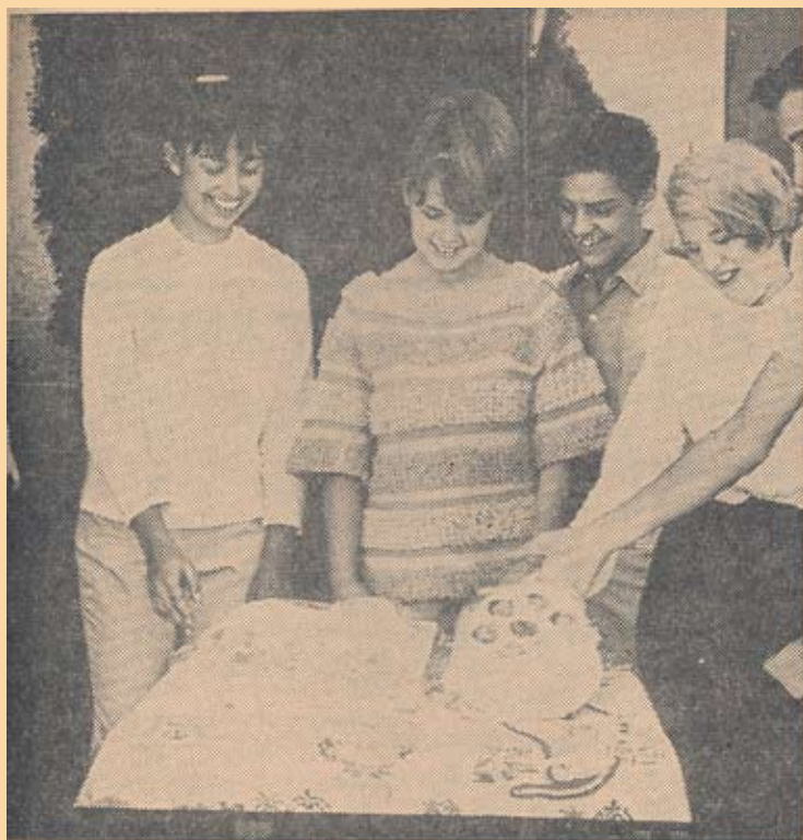
Sophomores heroically restrain their appetites for the sake of the picture of the Sophomore Bake Sale.