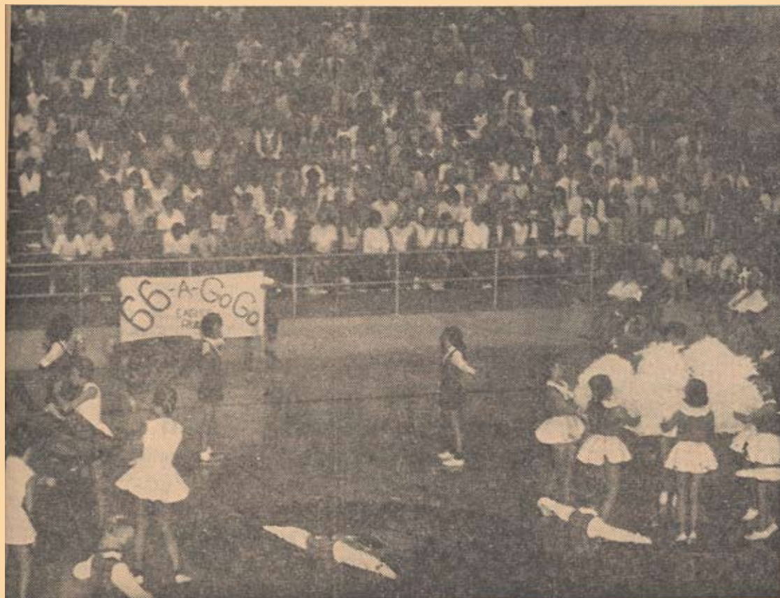
Pom Poms pom; Flag Twirlers twirl, and the Drill Team drills all together during last week's pep assembly for the San Gorgonio game.

The gentle roll of the sea, in the sun, The sparkling foam as the waves lap onto the shore, And no one need tell you of winter in the air. The quiet breeze bringing to water's edge the lonely call of the gulls, The new-born beach basking in the warmth of the once hidden sun, All of this and more is summer on the beach. Multi-colored creatures crawling, creeping, peeping from winter hideouts, The crisp, salty air so sharp you dare not inhale, The intense blue of the sky reflected in the mirror of the surf Glassy waves gaining in strength with each deep green swell, As the glories of spring arise from darkness. Tan-faded figures watching, only watching their sea with anticipation No man is half so alive as the sea. As fall rolls suddenly into winter. With every changing tide, a mood is revealed; A deserted beach, soggy with the slush of water-drenched sand, No attempt is made to hide its thoughts from others. Grey clouds and lightning filling the once peaceful sky, Unpredictable as it may be, the sea is always there, Monstrous breakers pounding where we once lay soaking Ready to accept friend or foe Into its restless bosom.