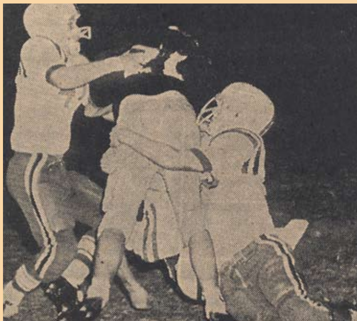
"I 'wanna' hold your hand!" shouts what's his face (?), No. 21, of No Gotta U, as he garciously judo chops two members of the opposing team.

effort. The team support at the games has been very good but not up to the highest level that it could be. It is true that our "home" games are clear over at Chaffey and that it is difficult for some people to get there, but if the team that plays football for you out there on the field is out every day after school practicing