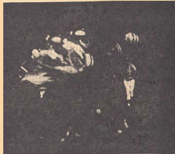
UNIDENTIFIED EAGLE is dragged down by his foes as another Eagle gets a birdseye view of the play.