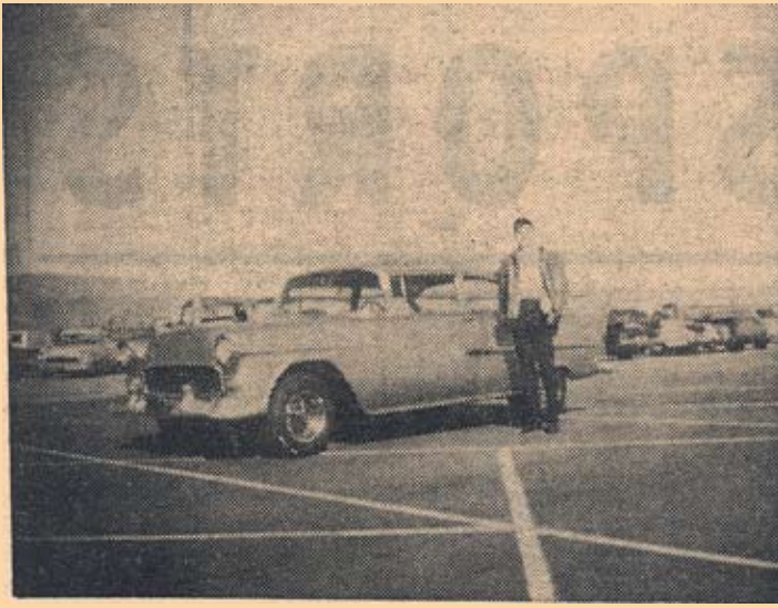
COACHMAN'S CAR SHOW Club Semi-Custom Entry.

This week's car is a '55 Chevy owned by Fred Comer, an Eisenhower senior. This car was recently entered as a club exhibition in the Coachman's Car Show. The exterior of the car is a freshly painted Marina Blue. Also, the semi-custom is running on M/T 9.50 inch slicks with Magnum 500 wheels. The interior is a very clean diamon-button pattern done in black leather. The headliner and side panels are done in flat black leather. Other features of the interior include Stewart-Warner gauges and a Covica steering wheel. The engine compartment is loaded with a 283 inch mill, bored to 301 inches. The powerhouse engine contains solids, Duntov cam, Jahn pistons and a Rochester quad. The trans. is stock, but the shift is a Hurst Syncro-Loc on the floor. Fred mentioned that he has invested over $1,000 in the car up-to-date and in a couple of months Car Craft magazine will be running a picture of Fred and his car.