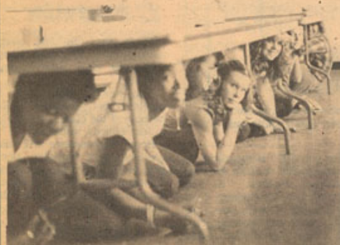
Duck and what?