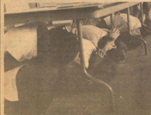
Oh, duck and cover