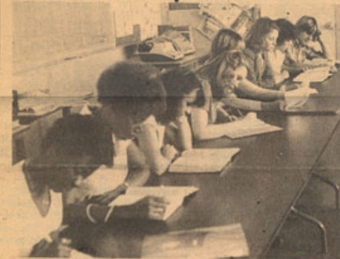
Studying hard... as usual. Suddenly the warning bell!