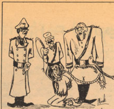
"You may thank him back. Punishment denied. Our quota has been filled."

That is "hazing." Sure, I've been "hazed" in that fashion. It's all supposed to build character and make a cadet so that pressure doesn't bother him. At